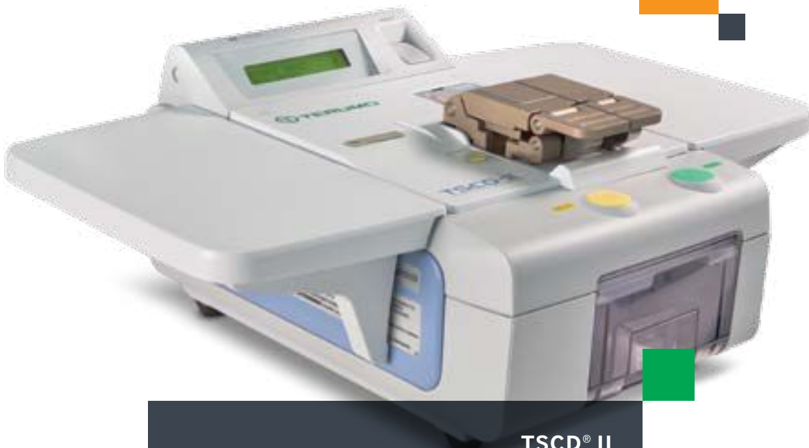
TSCD ® II NEXT-GENERATION TERUMO STERILE TUBING WELDER